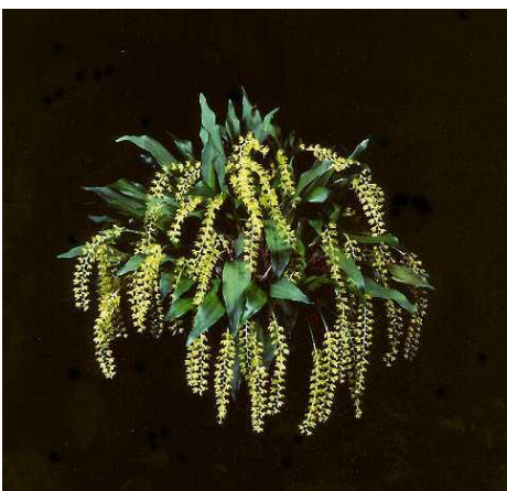
Left- Dendrochilum Formosum Right Dendrochilum Glumaceum inflorescence

Dendrochilums are in flower at the moment so try to get one while you can see the colour.