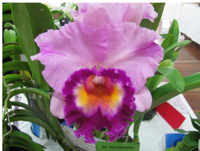
Blc. Dal's Monarch

Uniting Church Hall, Donaldson Road, Nambour