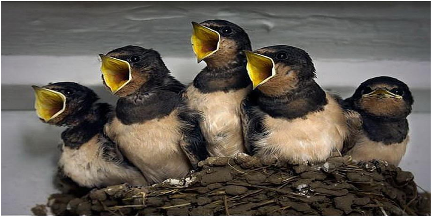
I just had to share this photo. Aren't they just beautiful