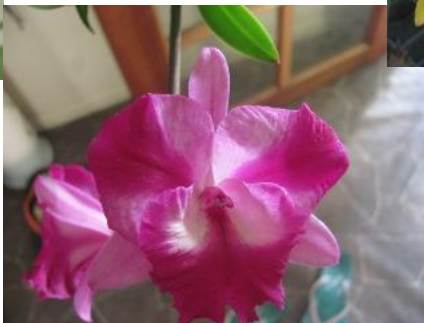
above C. Kindee x Lctna Peggy San