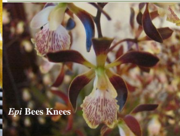
Epi Bees Knees