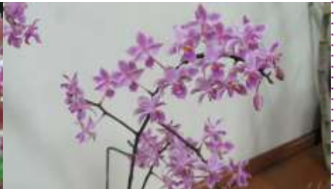
Phal. Little Skipper