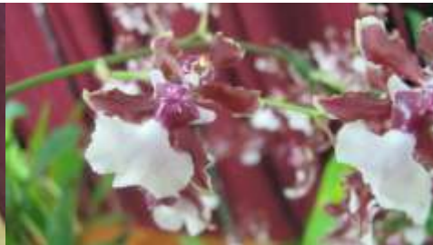
Onc. Sharry Baby