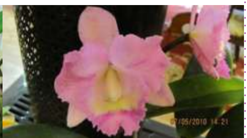
Bc. Dal's Charm