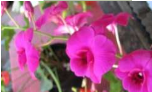
Den. Dal's Pride