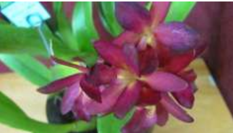
Ctna. Morse Code