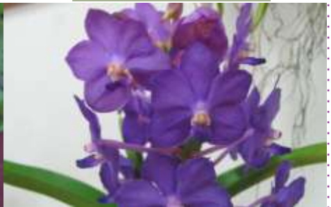
Vasco. Brisbane River