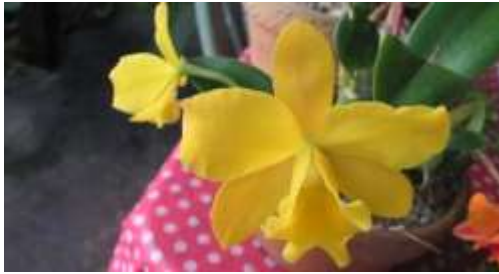
Pot. Free Spirit