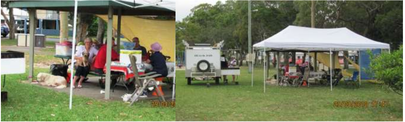
Our Christmas party at the beach. Lovely day shame more members did not attend.