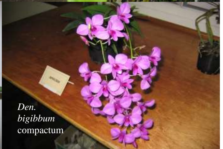
Den. bigibbum compactum