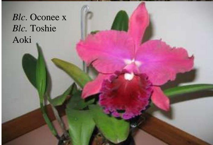
Blc. Oconee x Blc. Toshie Aoki