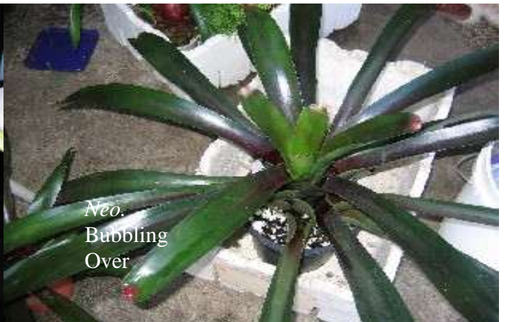
Neo. Bubbling Over