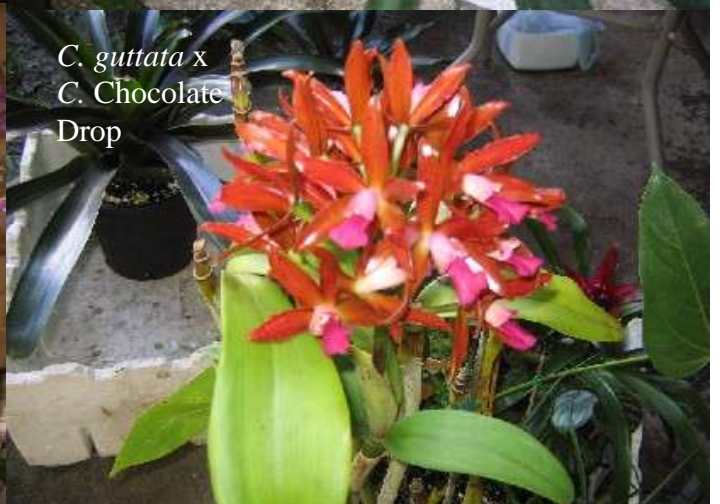
C. guttata x C. Chocolate Drop