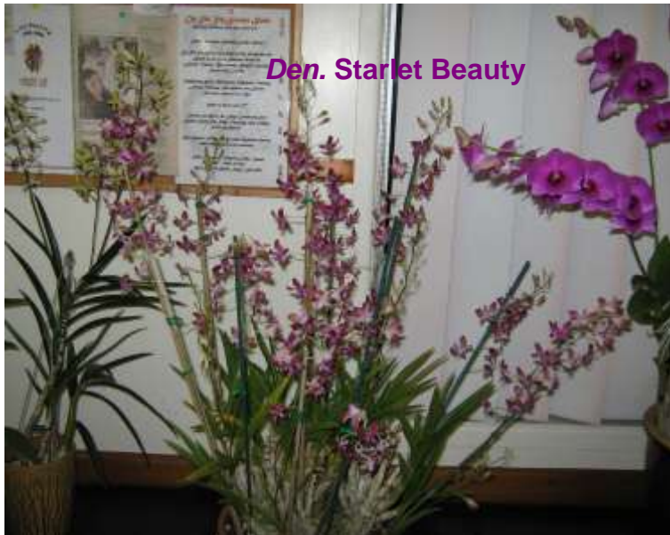
Den. Starlet Beauty