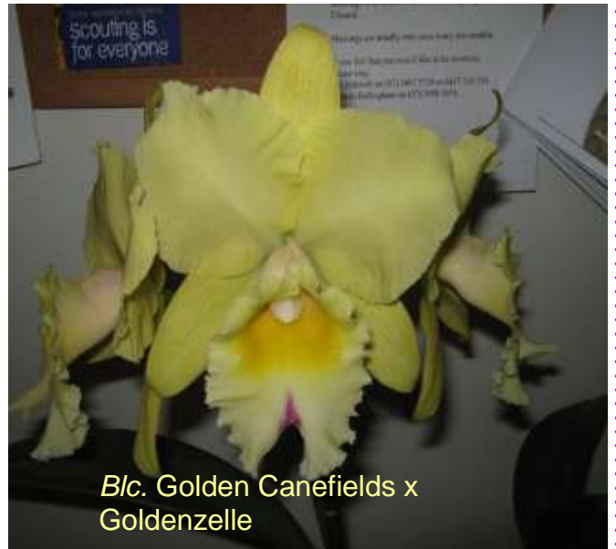
Blc. Golden Canefields x Goldenzelle