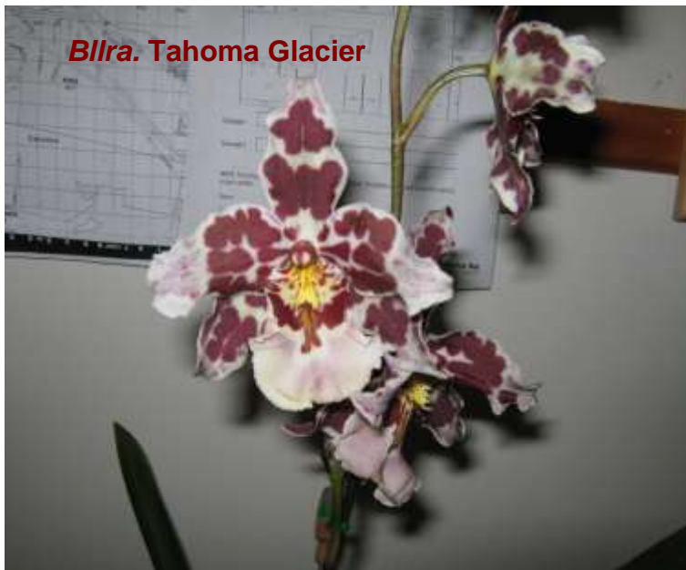
Blira. Tahoma Glacier